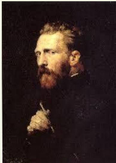
Vincent Van Gogh Impressionist Artist